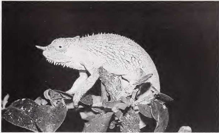
Fig. 1: Adult male of Chamaeleo (Trioceros) balebicornutus n. sp. from the Hareenna forest, Ethiopia.